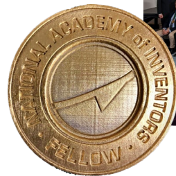
2024 CLASS OF FELLOWS