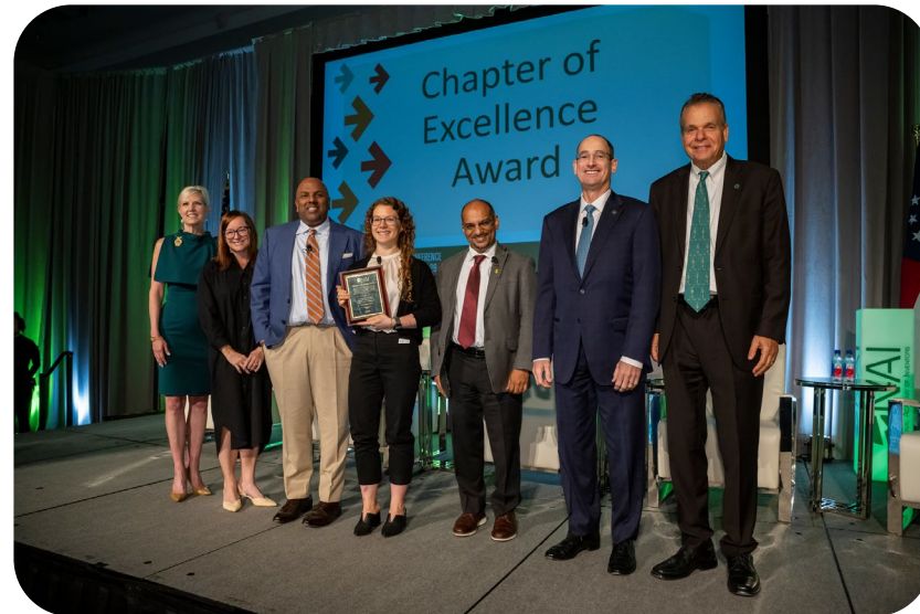
THE 2025 CHAPTER LUNCHEON, FEATURING THE CHAPTER OF EXCELLENCE FINALISTS AND AWARD RECIPIENT