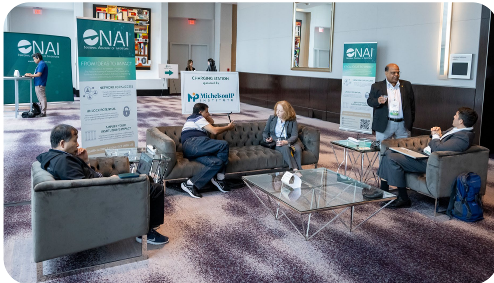
ATTENDEES TAKING A BREAK AT THE CHARGING STATION AT THE 14TH ANNUAL CONFERENCE IN 2025