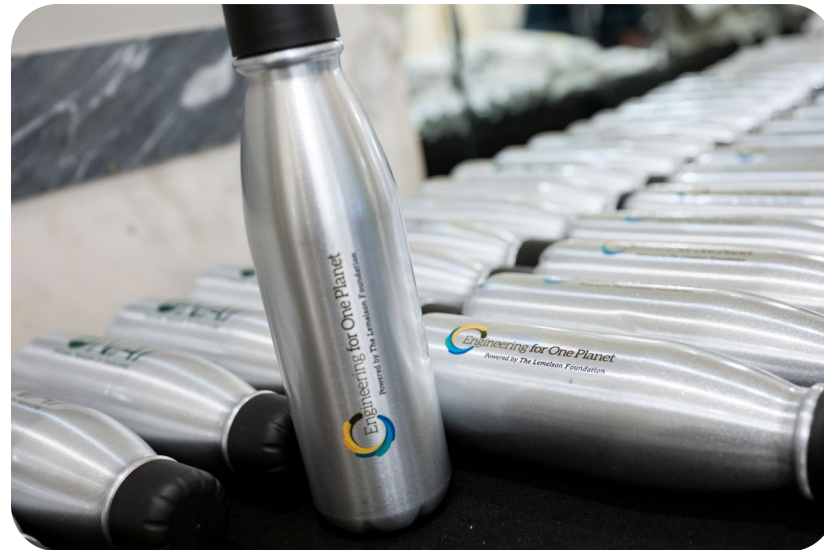
BRANDED WATER BOTTLE FROM THE 12TH ANNUAL CONFERENCE IN 2023 IN WASHINGTON, D.C.