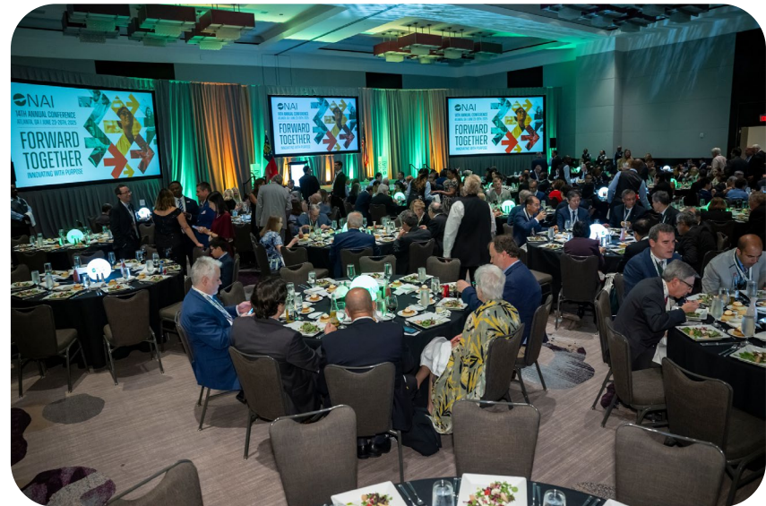
2025 ANNUAL CONFERENCE GALA