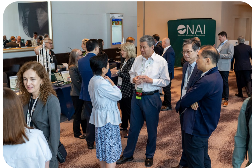
ATTENDEES ENGAGING IN THE REGISTRATION AREA AT THE 14TH ANNUAL CONFERENCE