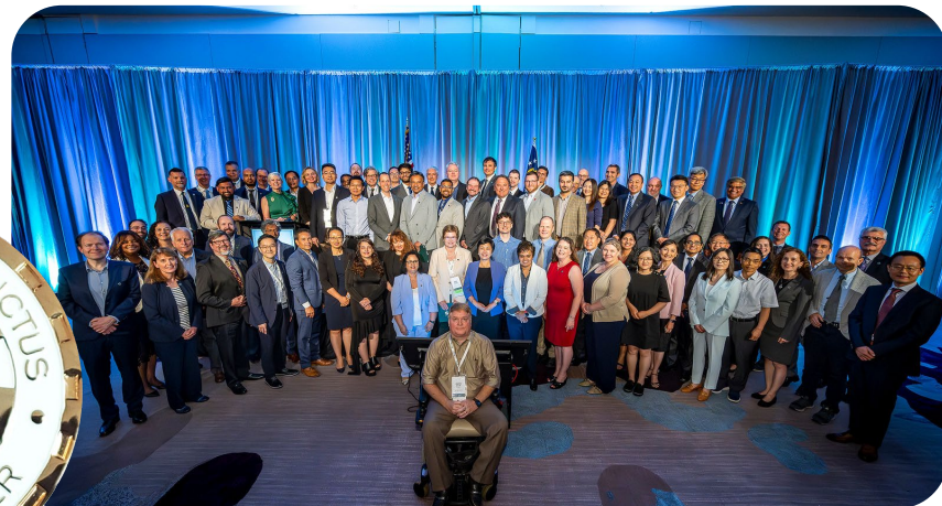
2025 CLASS OF SENIOR MEMBERS