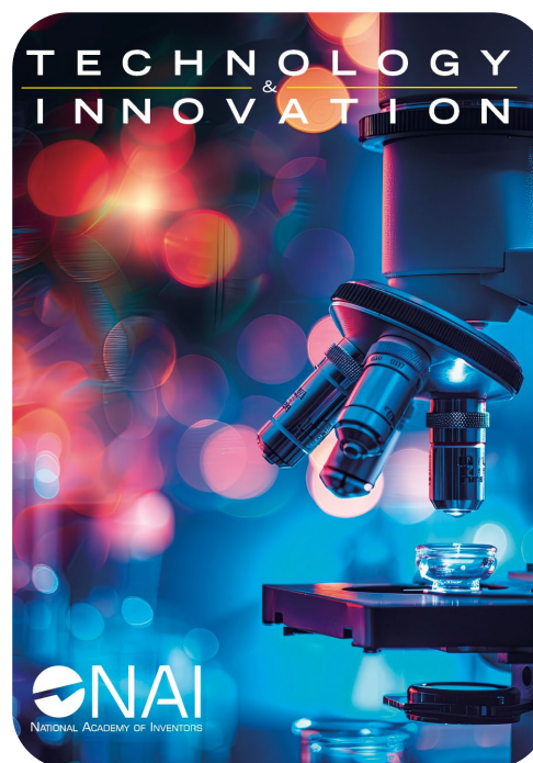
T&I JOURNAL COVER